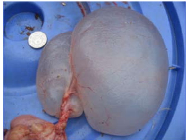
Figure 3: A thin walled cystic oviduct

In a large number of these 'false layers' a new variant of IBV was detected; early infection with this variant has been seen to result in a failure of the oviduct to develop, despite the other characteristics of sexual maturity occurring normally (Figure 4). The GD – Animal Health Service in Deventer, Netherlands, has typed this IBV variant as D388. This strain has been confirmed as being identical to the QX-like variant, which was typed and described in China in 2004.