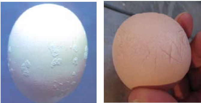
The egg on the left has calcareous deposits and the egg on the right has a soft shell.

Internally the albumin of the egg may become thin and watery with no clear distinction between the thick and thin albumin.