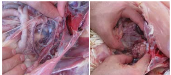
Figure 4: Examples of no oviduct development as a result of early infection with IBV

In a large number of these 'false layers' a new variant of IBV was detected; early infection with this variant has been seen to result in a failure of the oviduct to develop, despite the other characteristics of sexual maturity occurring normally (Figure 4). The GD – Animal Health Service in Deventer, Netherlands, has typed this IBV variant as D388. This strain has been confirmed as being identical to the QX-like variant, which was typed and described in China in 2004.